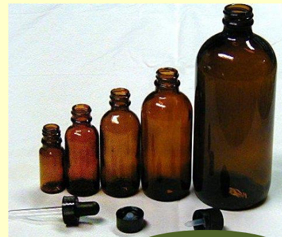
2 oz --32 oz