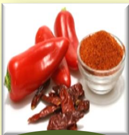
Dried & Fresh Cayenne