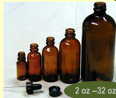
2 oz --32 oz