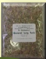
Dry Herb Kit ready to tincture