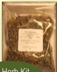
Dry Herb Kit ready to tincture