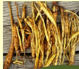
Yellow Dock Root