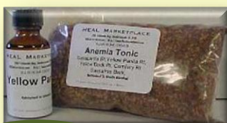
Dry Herb Kit ready to tincture